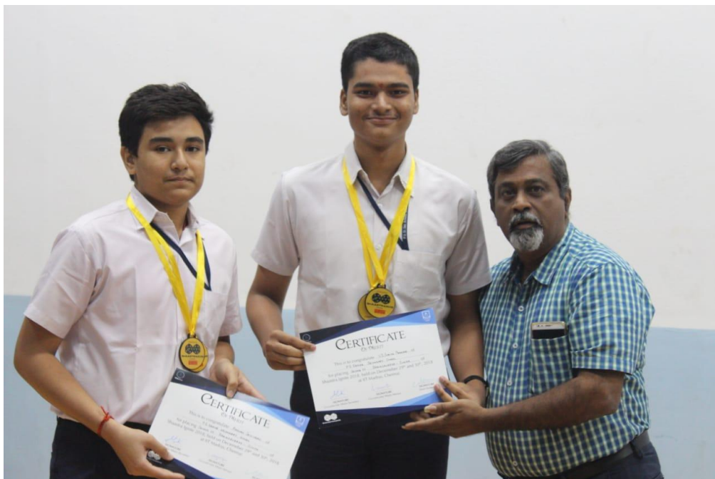
2018 – In the Painting and Essay writing competition held on 02/11/2018 conducted by The Hindu Tamil and Indian Oil Corporation the following students won special recognition Prize.