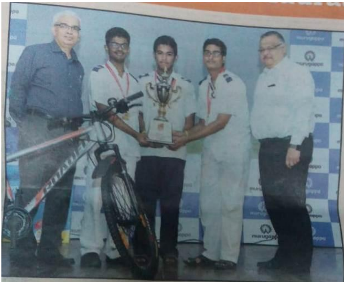
2018 –Our School won overall III position in IIT Madras Shastra Ignite 2018.